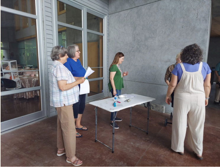
CWSG members discovering how to find out what the mystery fiber is during October's program.